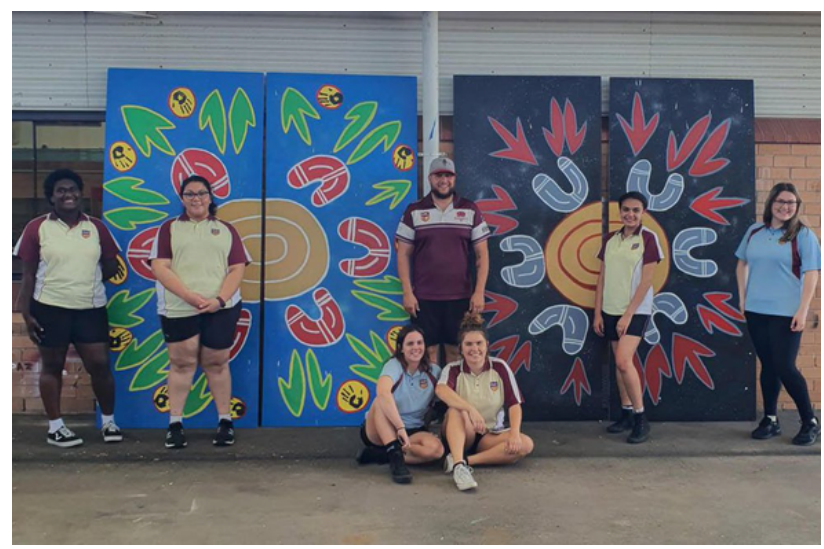
Rutherford Highschool - Aboriginal Learning and Engagement Centre 2020 Grant recipient

Mental Health Month events can be fun, thought-provoking, creative, engaging, sporty, and interesting.