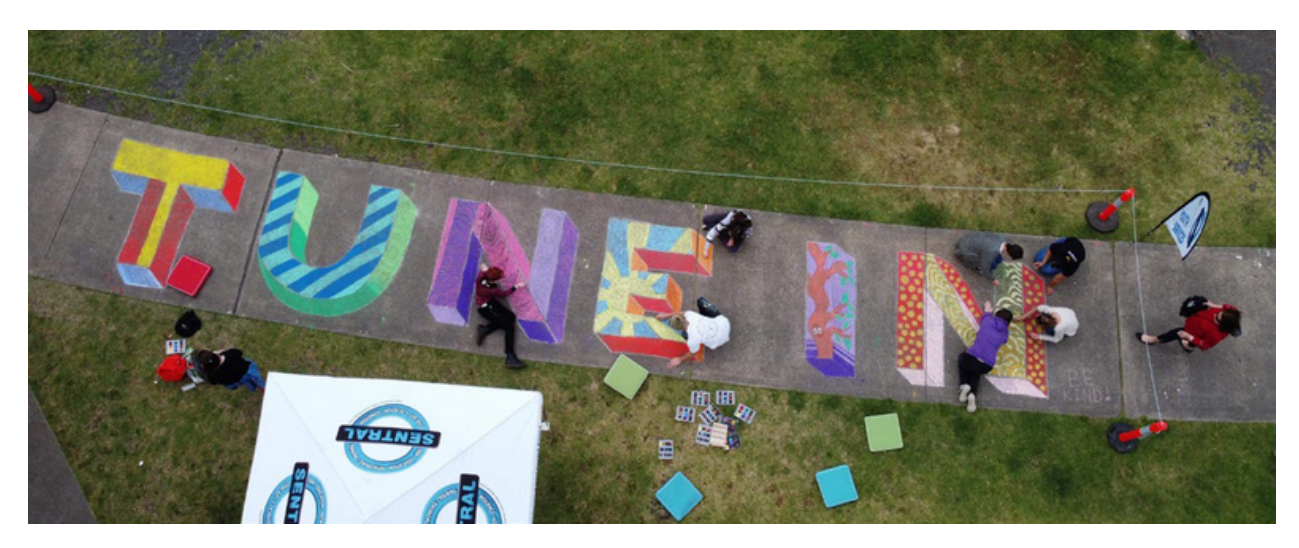
Kiama Council - chalk art workshops 2020 Grant recipient

• Chalk art can be used to decorate places where drawing is allowed in the community. Inspiring messages or notes can be left for others to see as they pass by during exercise time.